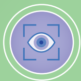
Image-guided superficial radiotherapy (IG-SRT)